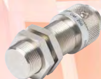
OM-200 Ignition pulse detector