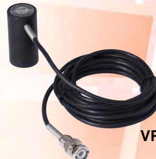
VP-202 Gasoline/diesel engine detector