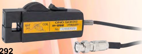
IP-292 Ignition pulse detector