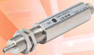
LG-916 Optic-fiber sensor/photoelectric reflection-type fiber detector (photoelectric system)