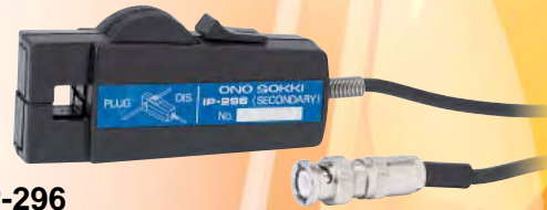
IP-296 Ignition pulse detector